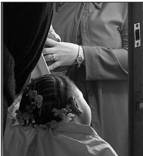
A child looks into the doorway of Shepherd's Place as she and her mother find shelter.