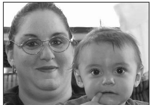
improve their quality of life. It is extraordinary and motivating to all of us each time a life is changed for the better.