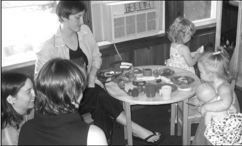
Children enjoy a new "playspace" at Shepherd's Place II while Horizons for Homeless Children volunteers look on following a ribbon cutting ceremony.